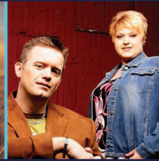
New Road 2