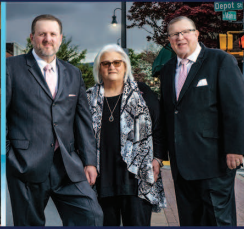
The Porter Family