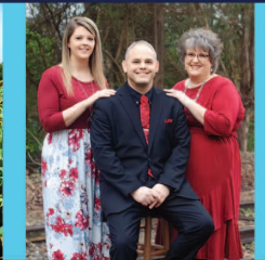
Heaven Bound Trio