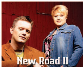
New Road II