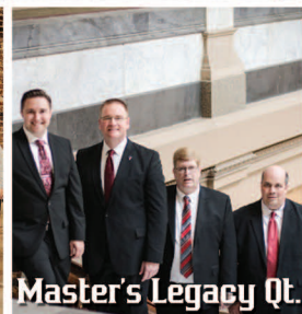
Master's Legacy Qt.